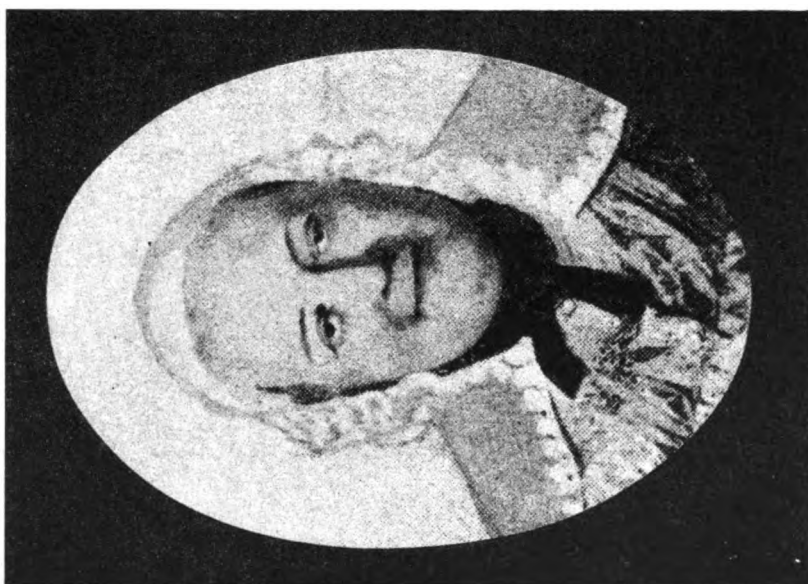
PRINCESS DOLGORUKI (MME. FADEYEF)