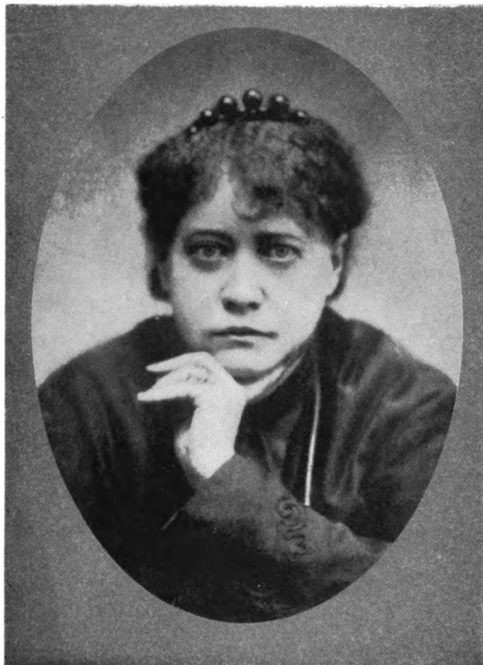
Lomaland Photo & Engraving Dept.